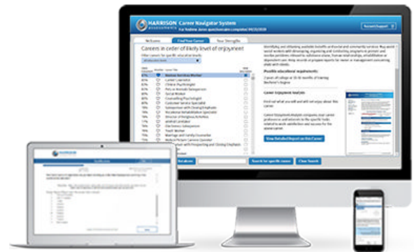
Online Interactive Career Portal